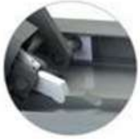
Precision machined safety locks