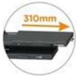
Single sided extendable