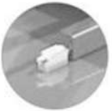
Height limit switch