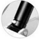
Safety valve for anti-explosion of hydraulic system